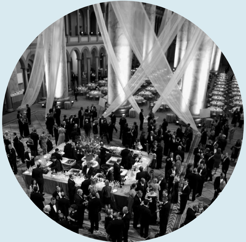
right: Guests at the 2009 Honor Award: Visionaries in Sustainability enjoy a cocktail reception in the Museum's majestic Great Hall.