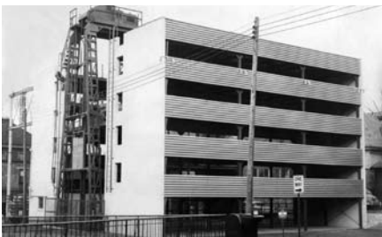
City Minit Park, Alliance, Ohio