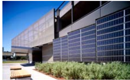
Fairfield Multimodal Transportation Center