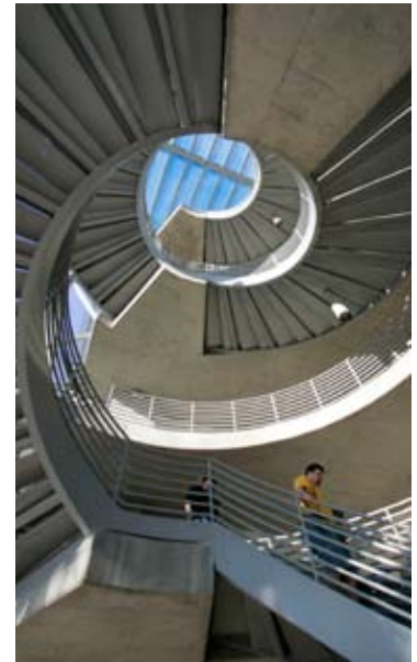
Packard Drive Parking Structure Staircase