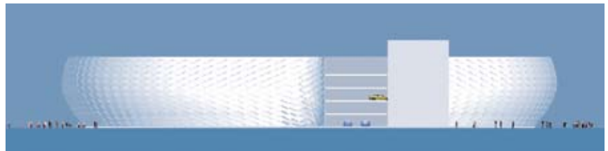
Revelle Parking Structure Rendering