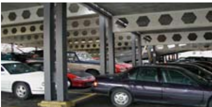
Cricklewood Apartments Garage