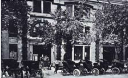
Dupont Garage, Washington, D.C.