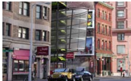
ZipCar Dispenser Proposal