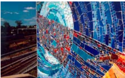
"Dawn & Dusk," AMTRAK/ Metro Station garage, New Carrollton, Maryland