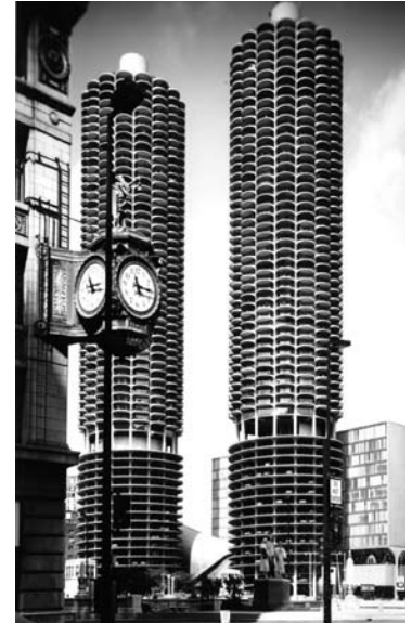
Marina City, Chicago, Illinois, 1959-67