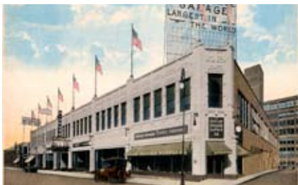
Euclid Square Garage, Cleveland, Ohio